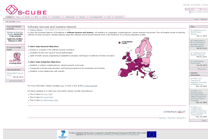
Figure 5: The S-Cube Web Portal home page

The outcome of the Page Rank analysis has further improved since last year. This is a very good result, considering that names similar to S-Cube’s are adopted by consulting firms (e.g. S-Cube Financial Consulting Ltd and Scube Scientific Software Solutions Ltd), a conference (the 1st International ICST