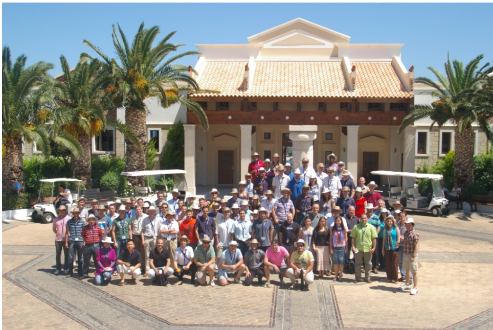
Figure 1: Group picture of the participants of the SSAI&E Summer School 2009

Many IST FP-7 projects participated to this summer school, with tutorials and presentations: S-Cube, Compliance-driven Models, Language, and Architectures for Services (COMPAS), PERSONALISED Self-Improving Smart spaces (PERSIST), Service Oriented Architectures for All (SOA4ALL), Interactive Realtime Multimedia Applications on Service Oriented Infrastructures (IRMOS), NEXOF Reference Architecture (NEXOF-RA), Dynamic Variability in Complex, Adaptive Systems (DIVA), Business objective driven RELiable & Intelligent for real busiNESS (BREIN), GRid Enabled access to rich meDIA content (GREDIA), Empowering the service industry with SLA-aware infrastructures (SLA@SOI) and Business and IT Alignment using a Model-Based Plug-in Framework (plugIT).