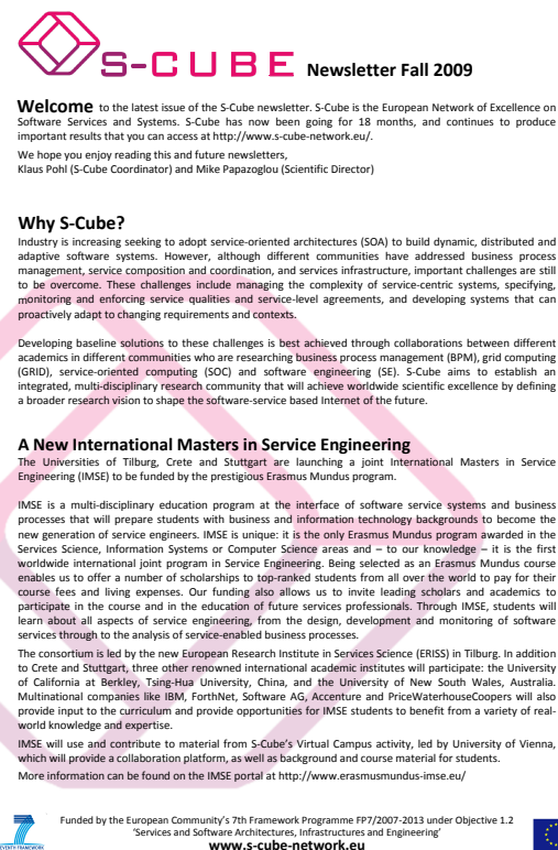
Figure 6: The S-Cube Newsletter for IC-SOC/ServiceWave 2009

The archive of the newsletters produced so far is available at: http://www.s-cube-network.eu/results/s-cube-newsletters .