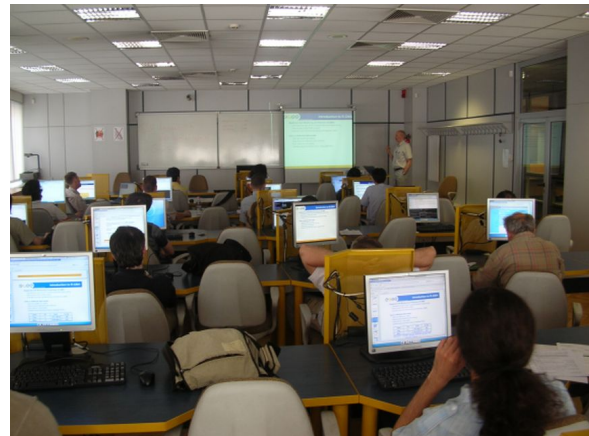
Figure 2: A presentation at the Joint EGEE and EDGeS Summer School

SZTAKI has organised the Joint EGEE and EDGeS Summer School on Grid Application Support (Figure 2) with the aim of giving insights to these technologies as well as to tools and programming environments by which user can develop and run applications on this enhanced grid infrastructure.