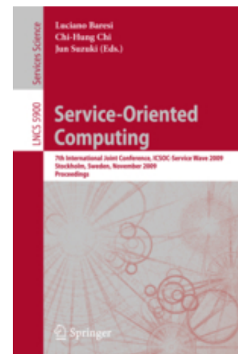
Figure 4: The Proceedings of ICSOC/ServiceWave 2009

The first volume published in the subline is the Proceedings of the Seventh International Joint Conference ICSOC/ServiceWave 2009 (Figure 4) held in Stockholm, Sweden on 24-27 November 2009.