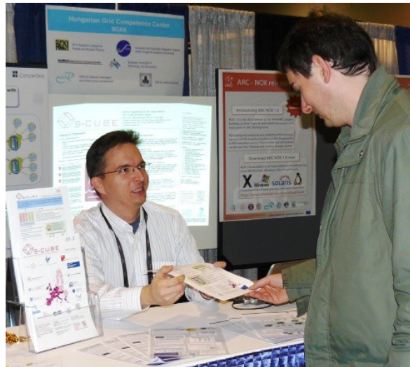
Figure 3: SZTAKI's booth at SC'09

S-Cube leaflets were made available at their booth (see Figure 3) and S-Cube slides have been projected.